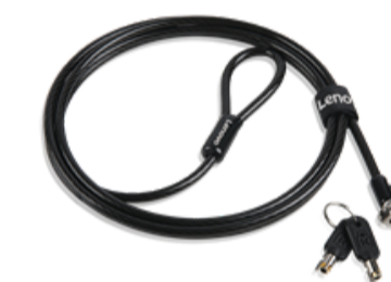
Kensington MicroSaver DS 2.0 Cable Lock from Lenovo