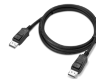
Lenovo DisplayPort to DisplayPort 1.4 cable 1.8m