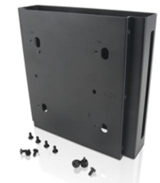
ThinkCentre Tiny Sandwich Kit II