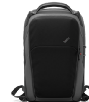
ThinkPad 16" Click-Go Backpack (Aura Edition) 4X41V20931