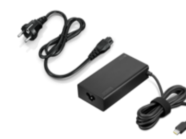
Lenovo USB-C 100W AC Adapter-IL