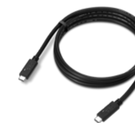
Lenovo USB 20Gbps USB-C to USB-C Cable 1.5m