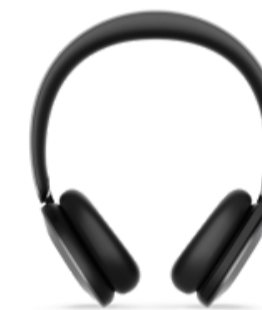
ThinkPad Dual-Mode Wireless ANC Foldable Headset 8550 (Aura Edition) - USB-A,...