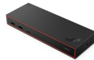
ThinkPad USB4 Dock 5000 (with 135W Adapter)