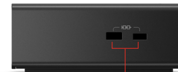
Kensington Lock Slots