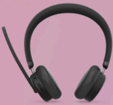
Lenovo Dual-Mode Wireless ANC Headset 6550 (USB-C, Teams) 4XD1S19778