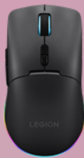
Lenovo Legion M220 Wireless RGB Gaming Mouse GY51U28359

Lenovo may not offer the products, services or features discussed in this document in all regions. Lenovo may withdraw an offering at any time. Information is subject to change without notice. Consult your local representative for information on offerings available in your area. Lenovo reserves the right to change specifications or other product information without notice. Lenovo is not responsible for photographic or typographical errors. Lenovo provides this publication "as is" without warranty of any kind, either express or implied, including the implied warranties of merchantability or fitness for a particular purpose.