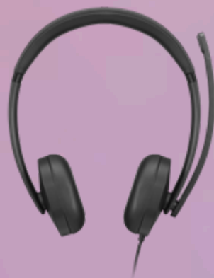
Lenovo Wired VoIP Headset 5000 4XD1R88995

Please click here to view the full list of accessories.